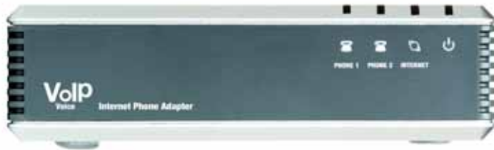
Figure 2-2: Front Panel

The Phone Adapter's LEDs, which inform you about network activities, are located on the front panel.