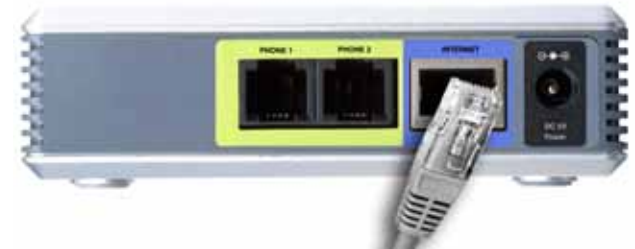
Figure 3-3: Connect the Ethernet Network Cable

The installation of the Phone Adapter is complete. Now you can pick up your phone and make calls.