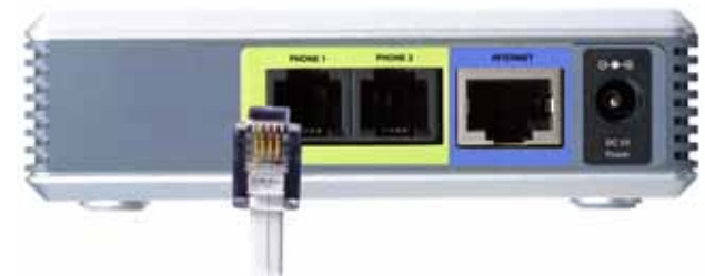
Figure 3-2: Connect the RJ-11 Telephone Cable

IMPORTANT: Do not connect either of the Phone ports to a telephone wall jack. Make sure you only connect a telephone or fax machine to either of the Phone ports. Otherwise, the Phone Adapter or the telephone wiring in your home or office may be damaged.