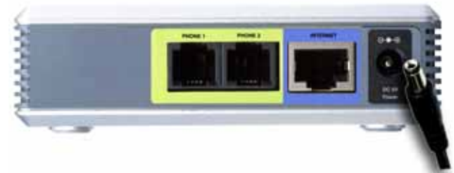
Figure 3-4: Connect the Power Adapter